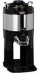
TF SERVER, 1G/3.8L MECH