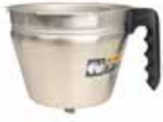
FUNNEL ASSY, W/ INSERTS SMTF