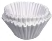
FILTERS, 20x8 252/CS 36/CL Product #: 20111.0000