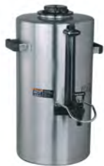
TITAN TF SERVER, VERTICAL FCT