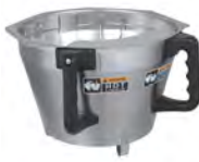
FUNNEL ASSY W/ BASKET, TITAN Product #: 40114.0000